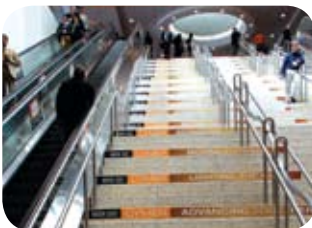
A Every third step