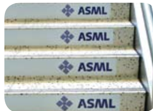
B Every step