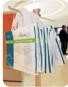
Exhibit Hall Show Bags